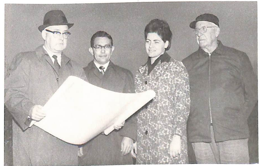
Department of Parks and Recreation