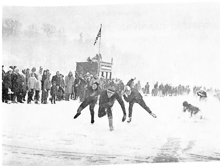
Faster Than The Wind