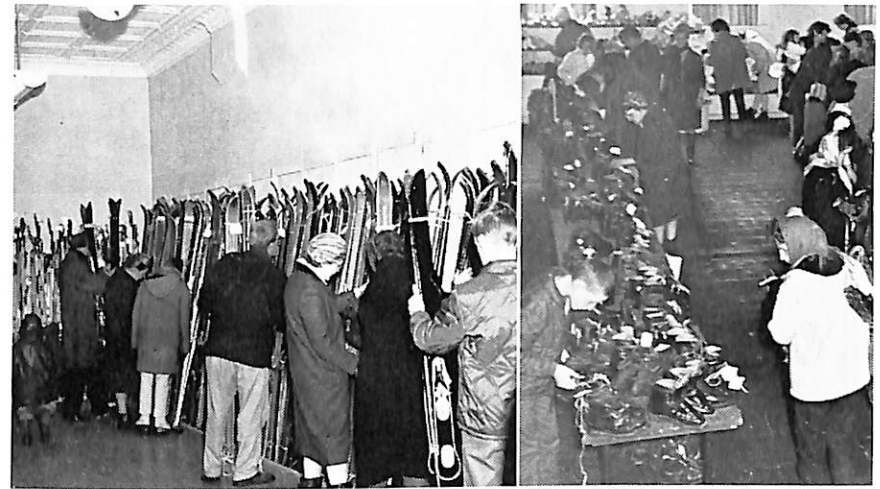
Follow The Crowd . . .