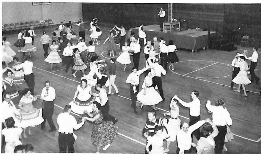
Let's Do A Grand Sashay